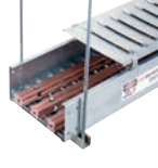
Fire and Performance Wiring